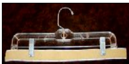
Fig. 2. When caregiver is ready to start strapping, build a basic strap organizer – just clip a strip of Velcro® loop onto a common pants hanger.